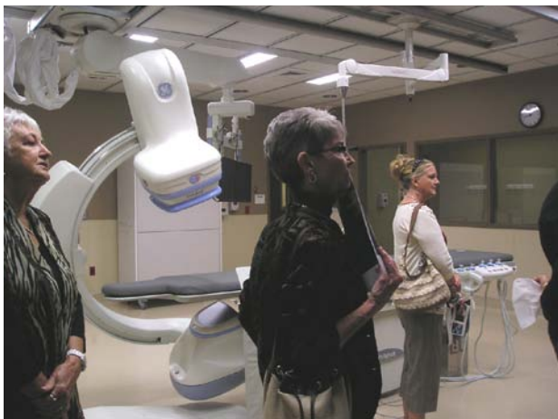
College alumni take a tour of one of the operating suites in the new Saint Luke's Mid America Heart Institute.

Alumni had an opportunity to tour the state-of-the-art New Saint Luke's facility on the Plaza, which houses Saint Luke's Mid America Heart Institute. Many alumni also ventured into the older areas of the hospital for a trip down memory lane, dating to their days as "probies," or nurses in training.