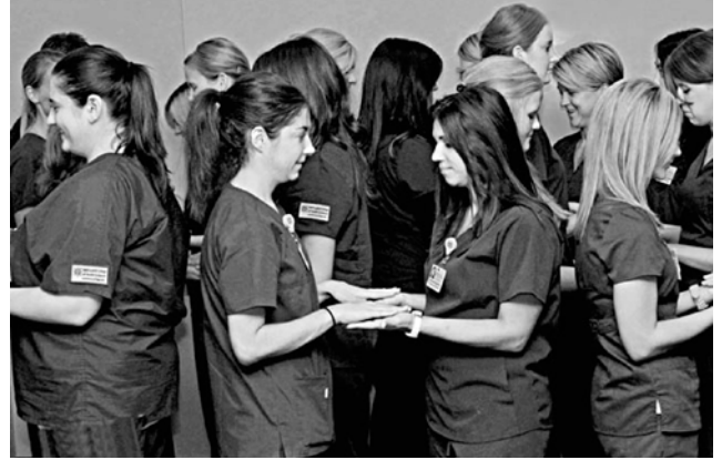
The induction concluded with the Blessing of the Hands.