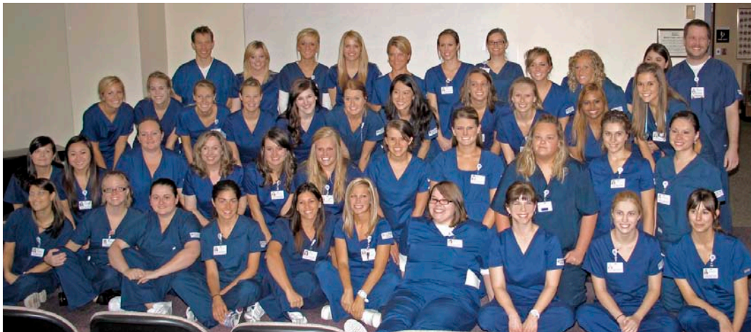
Forty-eight junior class nursing students participated in the Professional Induction ceremony in August.