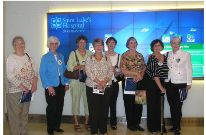
The Class of 1959 checked out the interactive history wall featured in the New Saint Luke's.

The events included an educational seminar presented by author and international speaker Bobbe White. The topic of her presentation was "Try Laughter . . . Just for the Health of It!" The seminar was enjoyed by alumni, faculty, current students, and nurse managers within Saint Luke's Health System. A reception followed at the college, allowing alumni, nurses, and current students to participate in student-led tours and to view architectural drawings of the new simulation and education facility opening in January 2012.