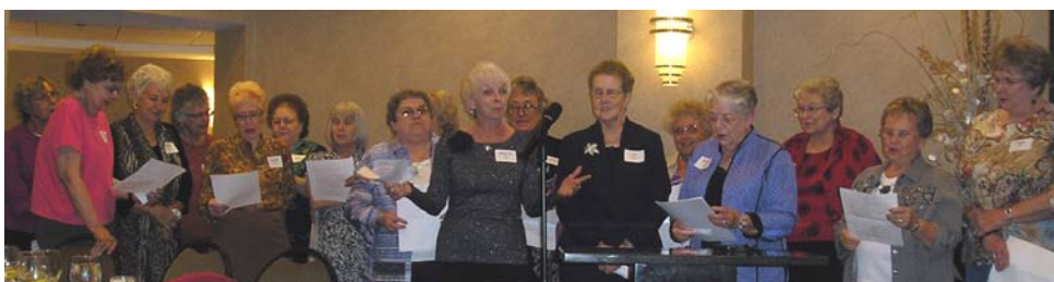
The Class of 1961 closed out the reunion by singing two songs they learned as nursing students.