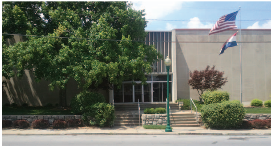
Saint Luke's College of Health Sciences is moving to 624 Westport Road in Kansas City.

Please join us as we look forward to the future success of Saint Luke's College of Health Sciences. Growth and expansion of the college would not be possible without the financial support of our alumni and community.